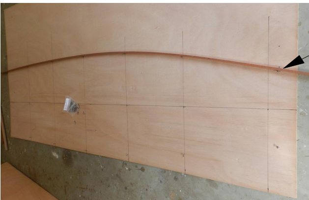
Timber batten approx 25mm x 6mm

Ensure the two sides are the same shape. The curves should be a fair line, even if they do not quite touch every point use a sharp pencil or ball point pen