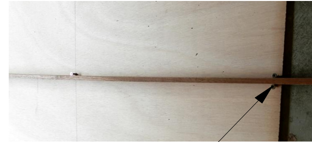
twin screws to hold batten

Adjust the screw positions if necessary to ensure a fair curve